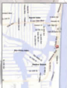
Pier 66 Fort Lauderdale