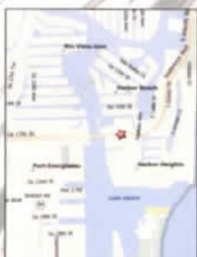
Bahia Mar Fort Lauderdale