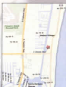
Sands Harbor Pompano